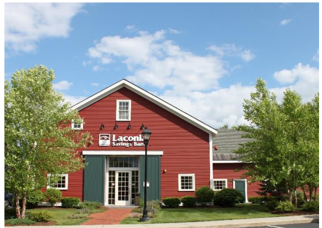
Images above are examples of new construction using New England style architectural design.