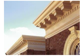
Examples of cornice design on flat roof structures

704.12 The roof of a structure shall be designed so as to divert the fall of rain and snow away from pedestrian areas, such as walkways and doors. The use of canopies, awnings or similar protective designs is also encouraged at entry locations.