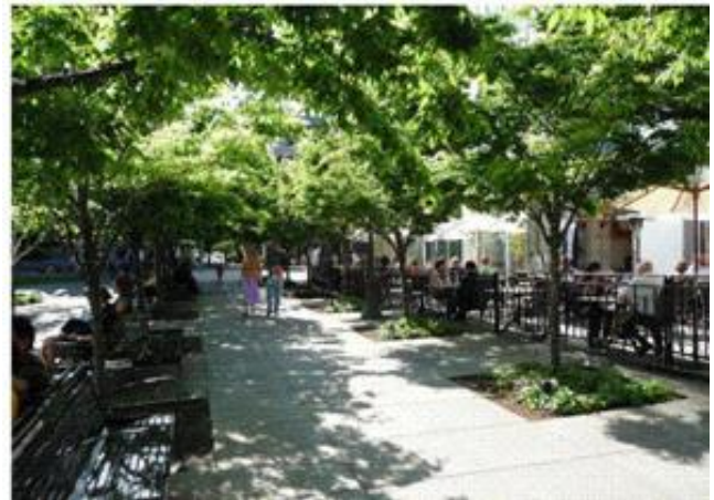
Pedestrian walkways within development areas

505.2.5 Walkways: Pedestrian walkways within the site shall be provided to connect pedestrians to public sidewalks and parking lots, as well as to adjacent existing developments within the District. Pedestrian connections to future developments shall be part of the site planning. Walkways shall be clearly visible to motorists and bicyclists and provide the pedestrian with a full view of on-coming traffic at crossings. Except at road crossings, walkways shall be separated from parking lots and travel lanes by raised curbing. The minimum width shall be five feet, excluding bumper overhang in parking lots.