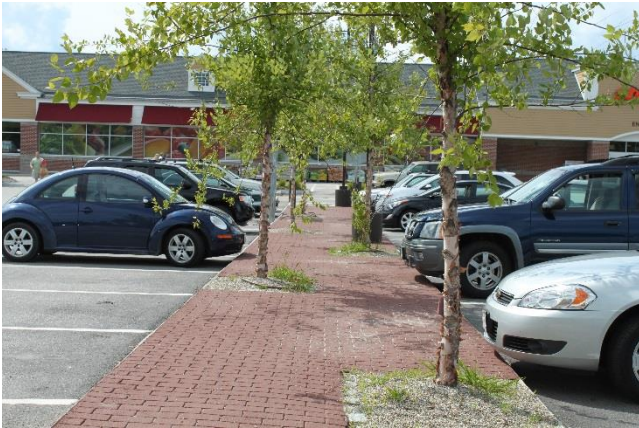
Pedestrian walkways in parking lots

504.2.10 Pedestrian Access: Safe pedestrian access shall be provided from parking lots to buildings. This shall include clearly marked and paved walkways, signage, and lighting. Crosswalks shall be clearly visible by the use of pavement markings or the change of pavement material, texture or color. Placement of plantings, signage and other elements shall not impede pedestrian visibility.