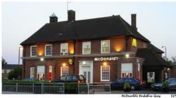
Examples of corporate franchises utilizing traditional architecture in a commercial district.

702.3 Corporate architecture is not allowed. Architecture that acts as signs (such as some fast food franchises) that uses architecture to define its corporate identity will not be permissible.