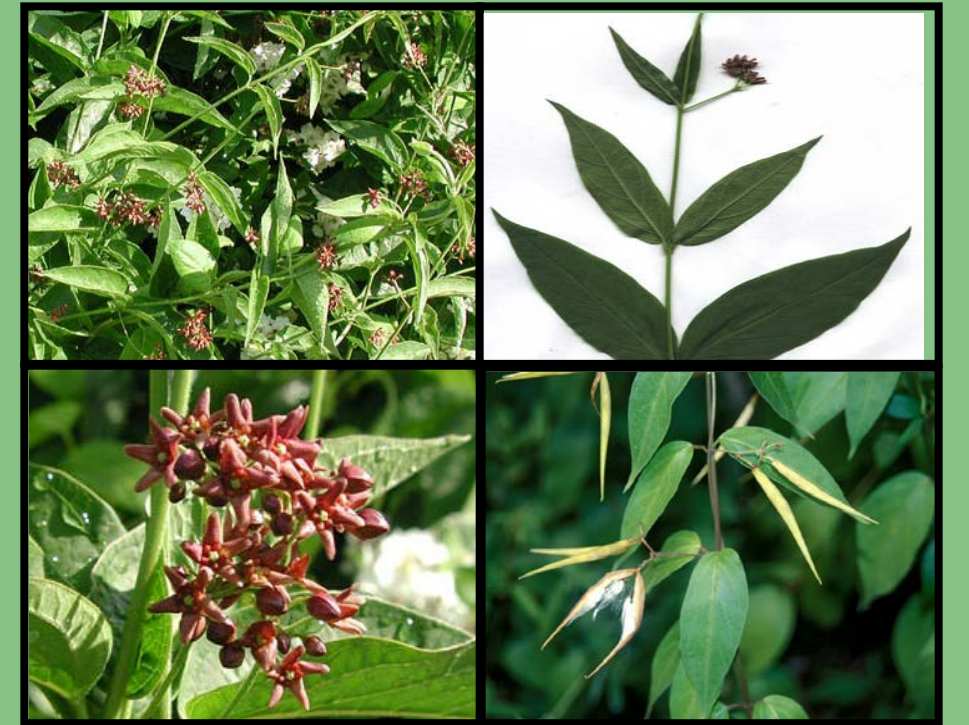
Pale swallow-wort ( Cynanchum rossicum )