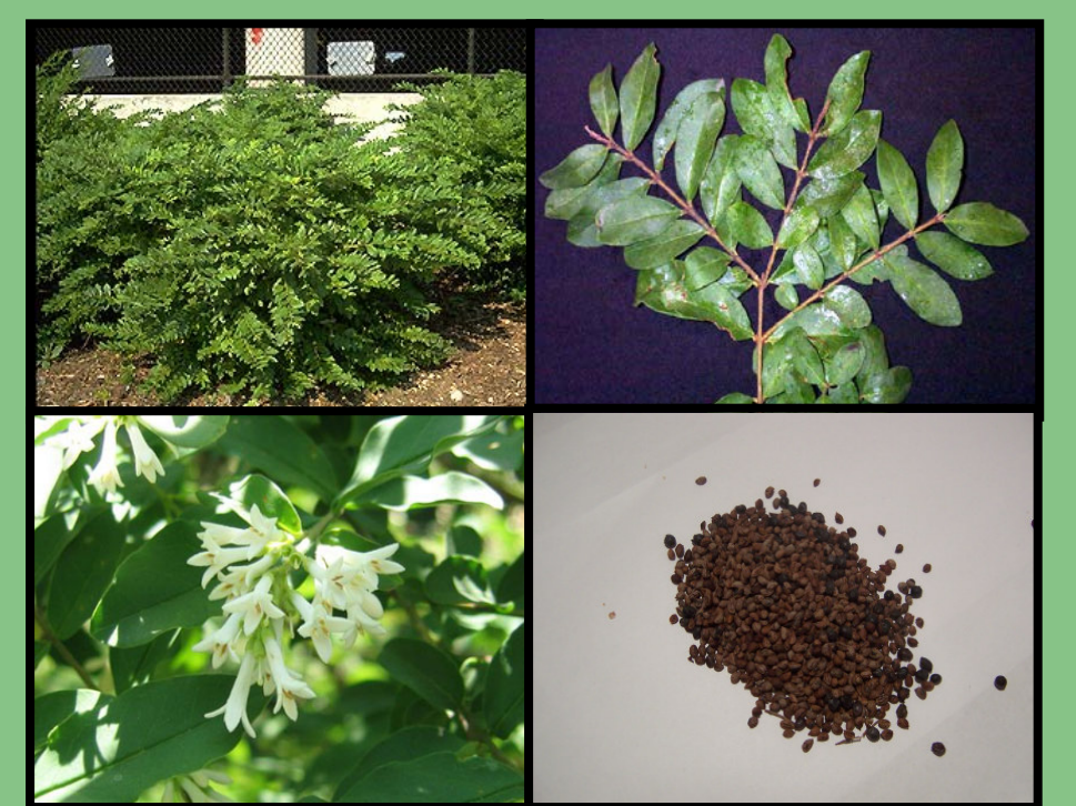
Blunt-leaved privet ( Ligustrum obtusifolium )