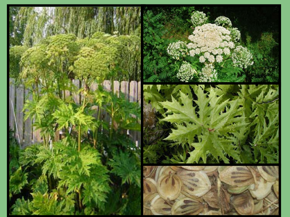
Giant hogweed ( Heracleum mantegazzianum )