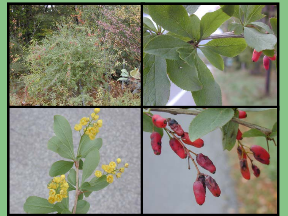
European barberry ( Berberis vulgaris )