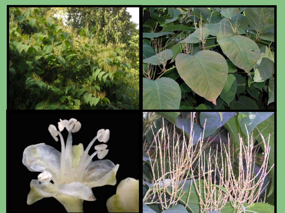
Bohemian knotweed ( Polygonum x bohemica )