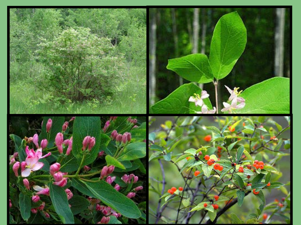
Tatarian honeysuckle ( Lonicera tatarica )